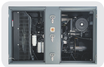
Perkins powered and rated @ 60°

Powered with Perkins engines and Leroy-somer alternators to offer you the best local support, backed with a 3 year - 1500hour warranty. Our range of generators meet all mine site and construction requirements, without the need of upgrade or installation of aftermarket parts.