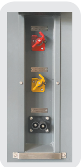
Fitted with isolators & Jump Start Terminal