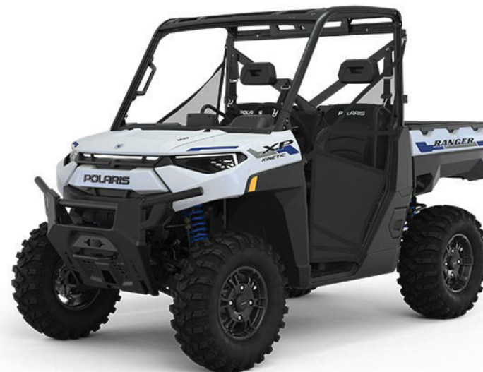
Colour: Icy White Pearl

*Range estimates based on manufacturer data on typical customer driving usage and conditions. Actual range varies based on conditions such as external environment, weather, speed, cargo loads, rates of acceleration, vehicle maintenance, and vehicle usage.