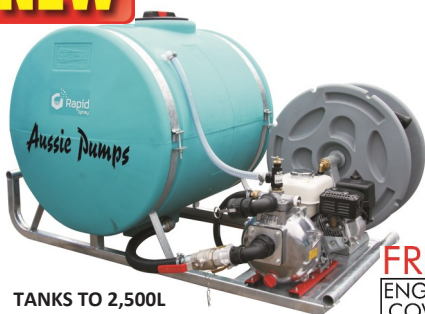
TANKS TO 2,500L