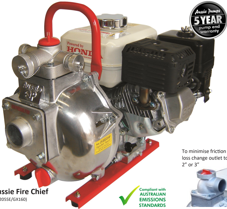
Aussie Fire Chief (QP205SE/GX160)

Compliant with AUSTRALIAN EMISSIONS STANDARDS